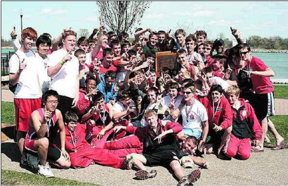
Orchard Lake St. Mary's crew celebrates winning the prestigious Hebda Cup in Wyandotte on April 28