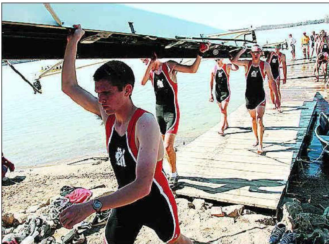
Members of the Orchard Lake St. Mary's lightweight eight crew team take a boat out of Orchard Lake after competing with St. Ignatius.

After the end of the races, the teams had a mass, St. Mary's had a boat dedication and then everyone went home.