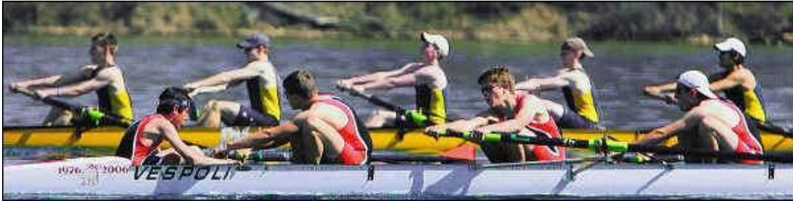
The Orchard Lake St. Mary's lightweight eight crew, front, rows against Cleveland's St. Ignatius, back, April 21 on Orchard Lake. The race marked the end of a grueling winter of training

During the morning of April 21, members of Orchard Lake St. Mary's rowing team awoke at dawn and met at a boathouse at 7 a.m. for the day's opening regatta.